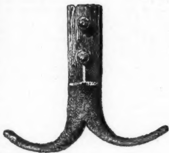
FIG. 1.—Bronze hook.

a handful or two of débris of lime at the bottom of the ascending portion of the channel, which had apparently fallen during the construction, and amongst this débris were found the granite ball and the piece of wooden rod and fragments. There was no indication of any draught in this north channel, and indeed the untarnished