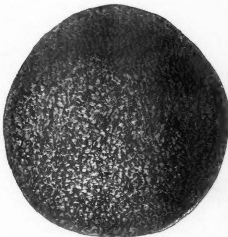
FIG. 3.—Gray granite ball.

(p. 755) has shown that in frequent instances, the Imperial modern pound, or unit of weight, differs very little from, and is therefore derived from, the ancient Egyptian